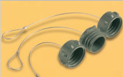
EXP-0990, EXP-0991, EXP-0992